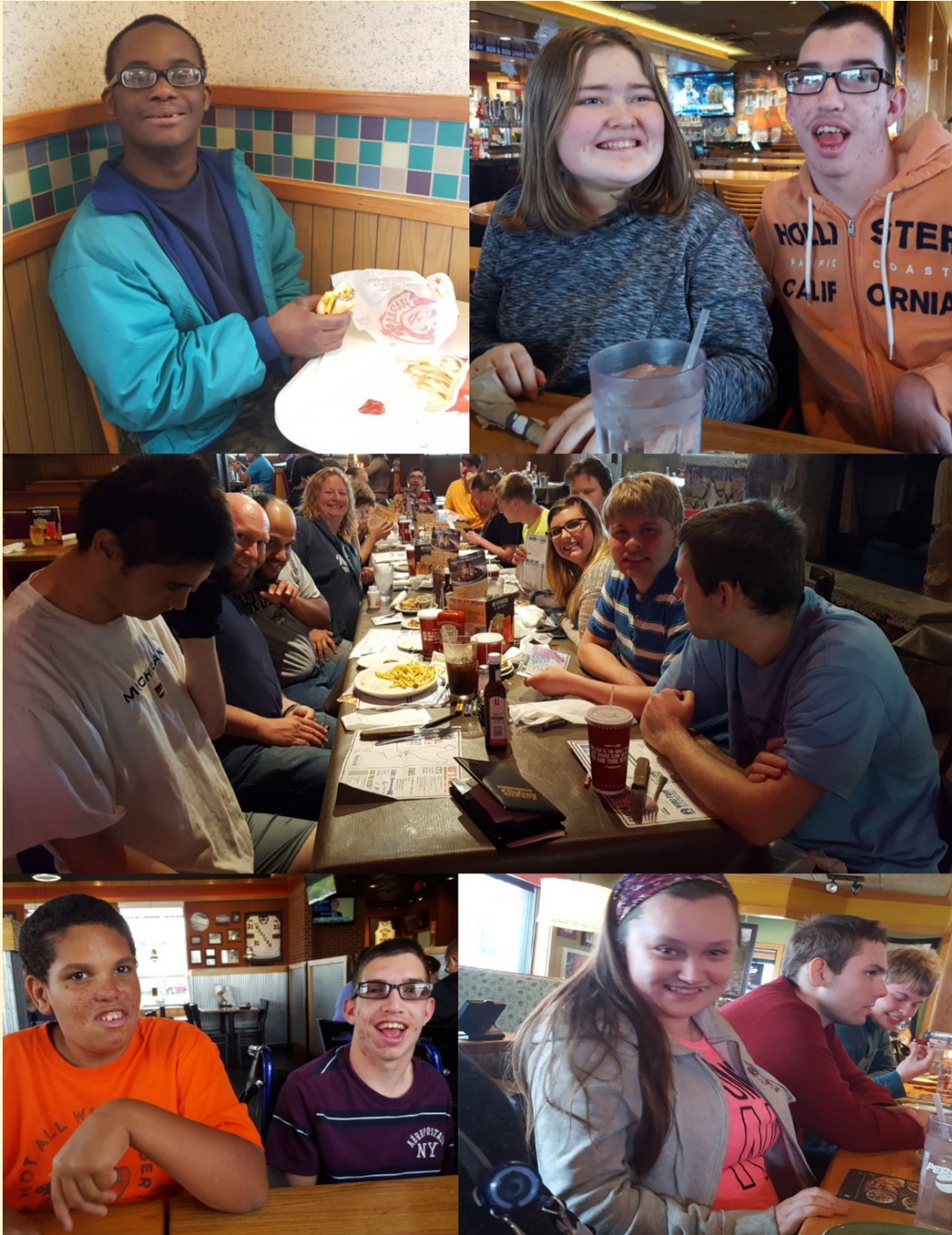
The students at WoodsEdge participate in Community Based Instruction (CBIs) where they practice skills in the community like: ordering at a restaurant, taking turns at a bowling alley, grocery shopping, navigating stores, and navigating unfamiliar places, like the apple orchard.