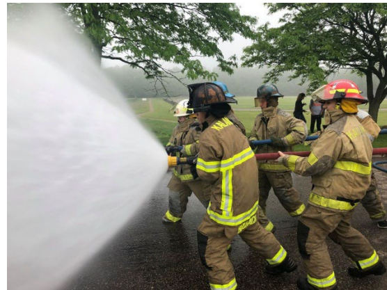
Public Safety Officer Training