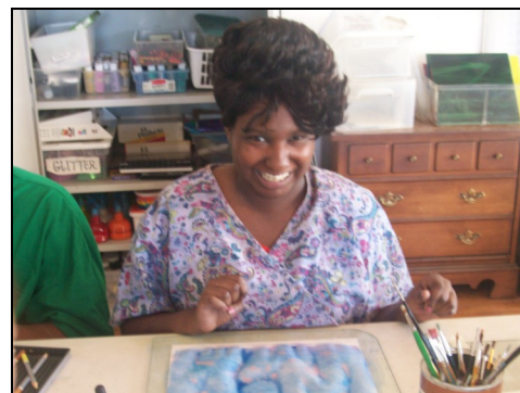
A watercolor by Ciera E.